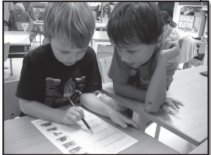
Pairs Check, Singapore

celebrate their own unique pattern of intelligences and that of others).