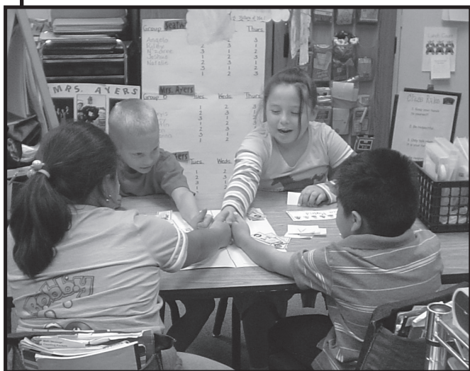
Spend-A-Buck, Las Vegas, NV

Although we cannot predict the future with certainty, we can be fairly sure that students who acquire thinking skills, social skills, and character virtues will be better prepared to