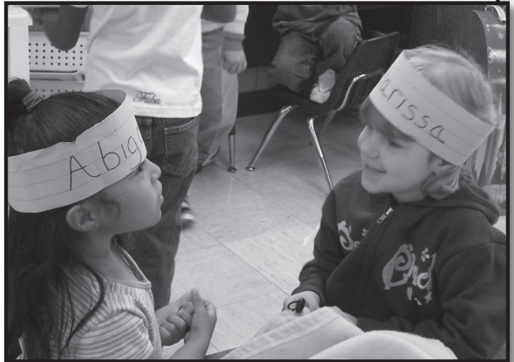
Timed Pair Share, Leander, TX

That the structures become part of any lesson is at the heart of institutionalizing structure-based change. Educational reform has been